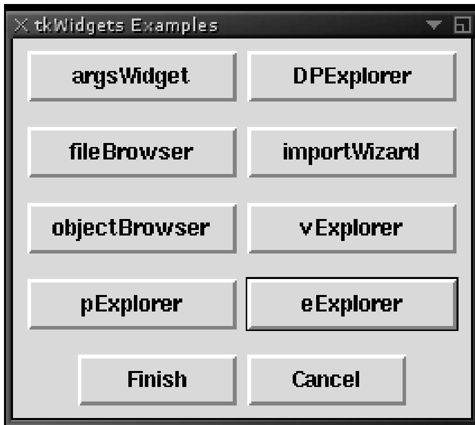
Figure 1: A snapshot of the widget when the example code chunk is executed